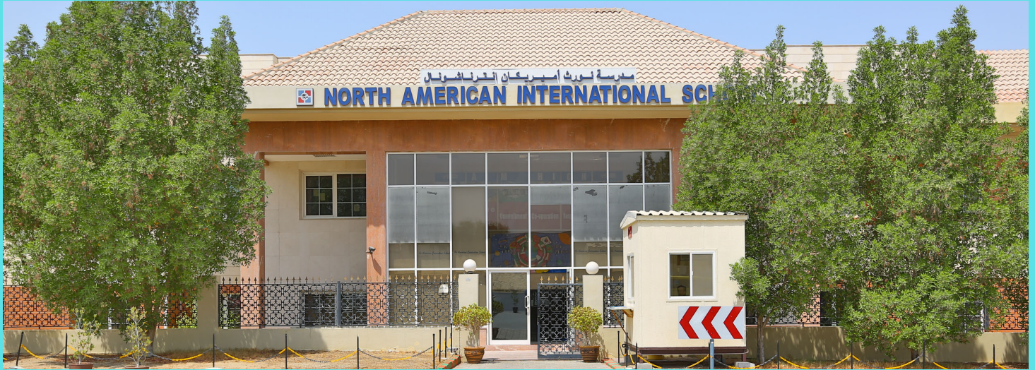
NORTH AMERICAN INTERNATIONAL SCHOOL